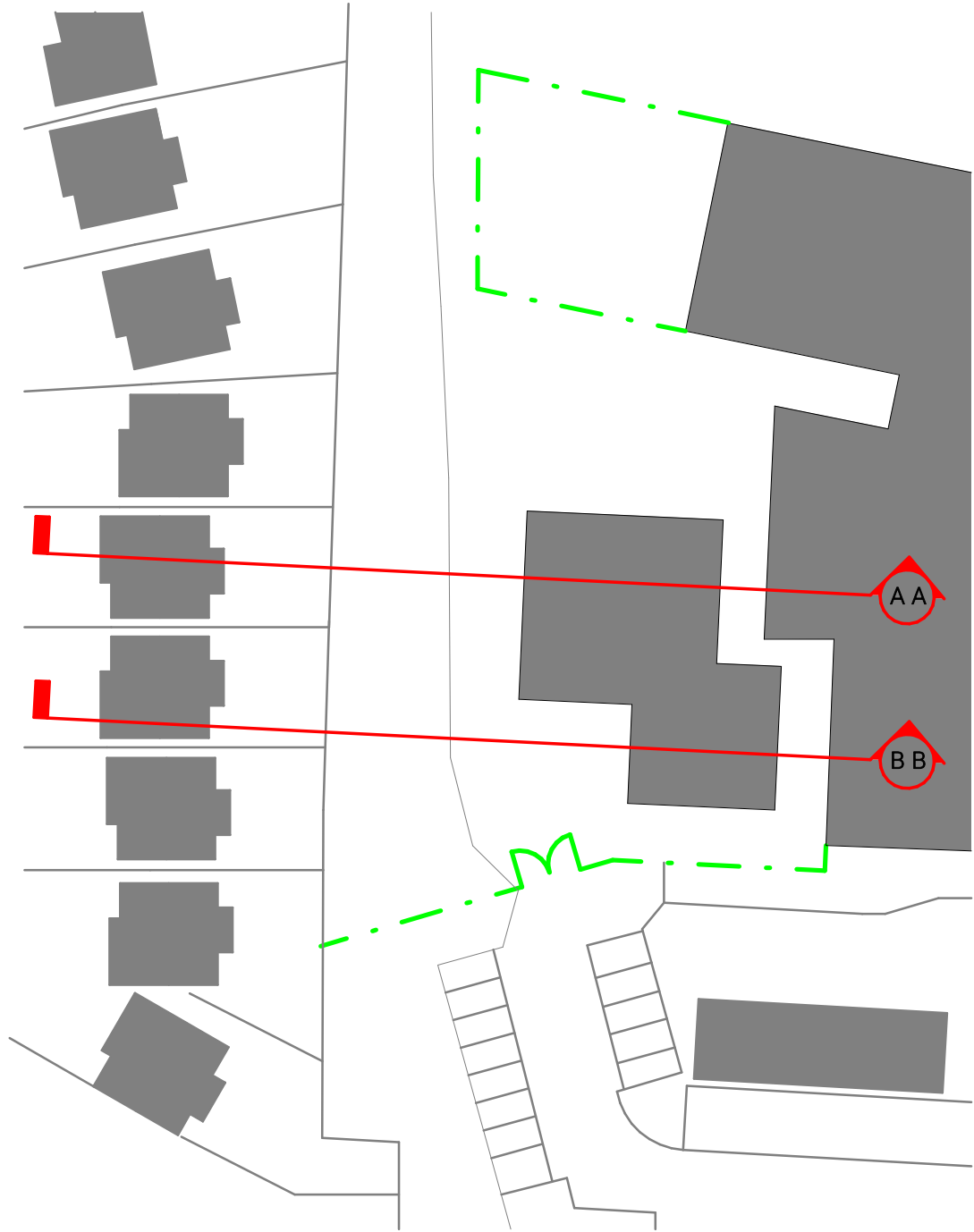
Site Section Location 1 : 500